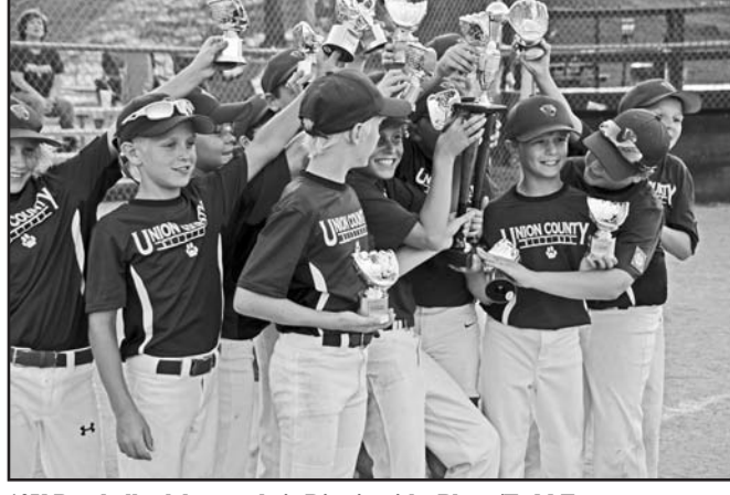
10U Baseball celebrates their District title.

At the plate, Patton went 2-for-4 with a homer, two runs, and two RBIs. Rice scored three times on two walks and a single; Totherow