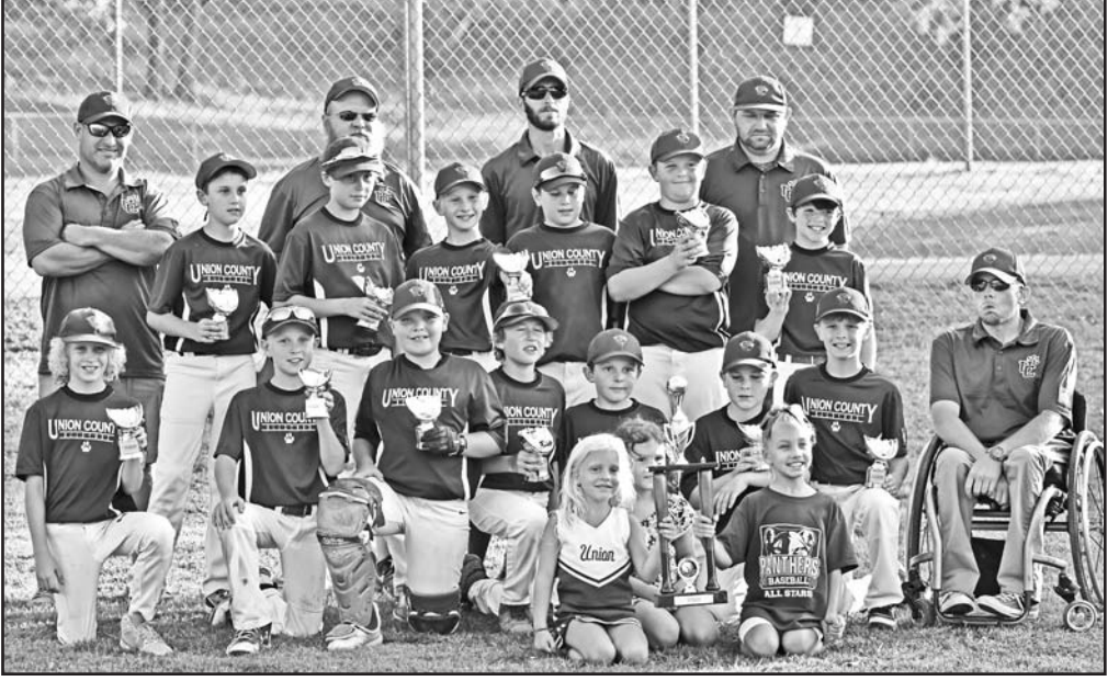
The Union County 10U Baseball team was on a mission during the District Tournament.

Union County in the championship game and the righthander struck out three while allowing just one hit in the win.